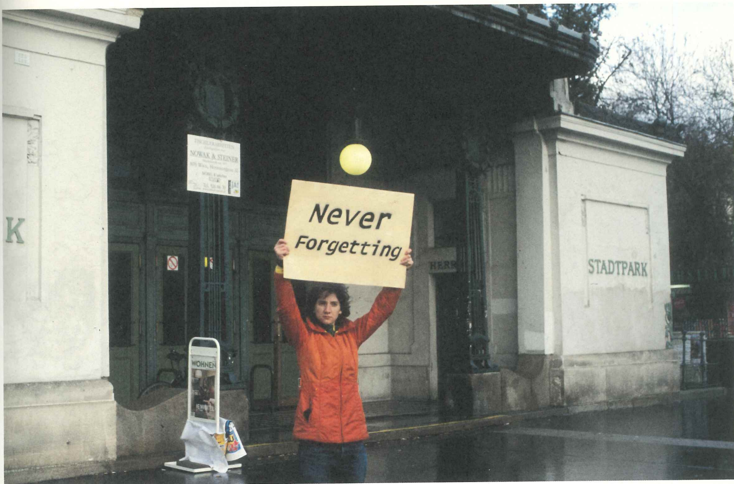
Sharon Hayes, In the Near Future, Vienna (detail) , 2006. Multiple-slide projection installation