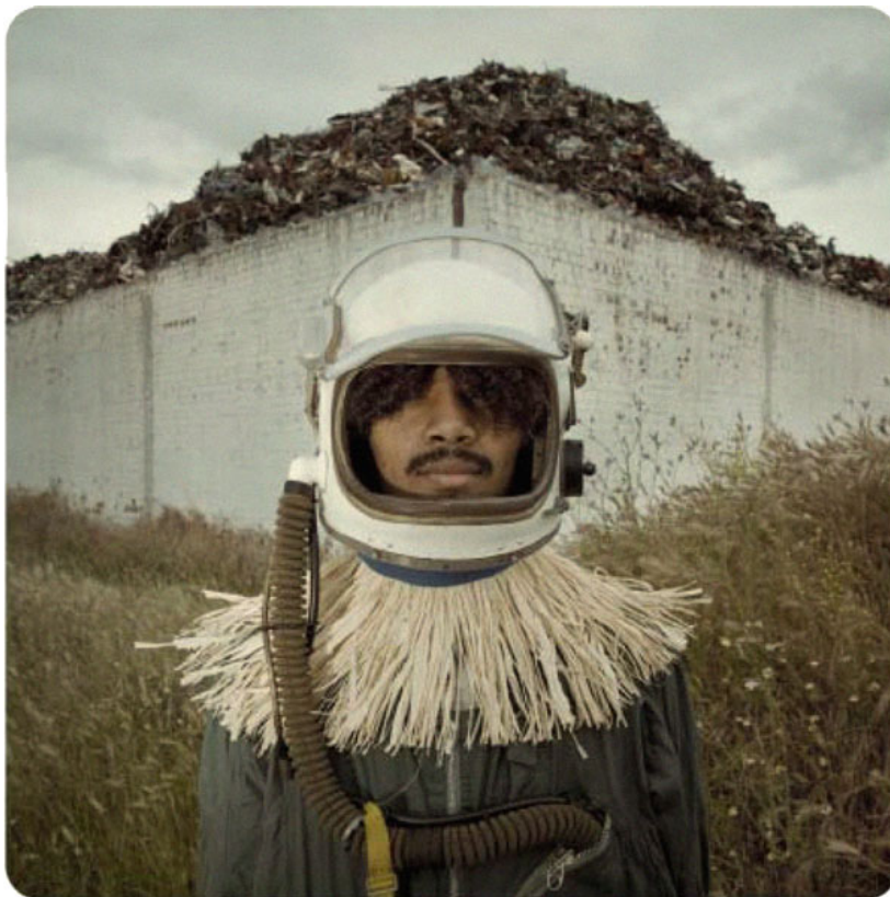
Cristina de Middel, The Afronauts , 2012. Digital C- print, 39 x 39 in.

As important as Fuller to artists today is the influence of musician and impresario Sun Ra (1914–93) and his influential space fascination in the 1960s and 1970s, a project that can be summed up as “We are all aliens.” 7 Ra’s landmark Afrofuturist works such as the 1972/74 film Space is the Place , and his albums and performances with his band the Arkestra, continue to be immensely popular, often-cited works in contemporary art, his experiments with modal polytonality and polyrhythmic beats looms large in contemporary culture. 8 Space is the Place , scripted in part from lectures Sun Ra gave while teaching a course in 1971 at UC Berkeley titled “The Black Man in the Cosmos,” follows Ra’s attempts to recruit African-Americans to a distant planet he hopes to settle. The plot centers on the menace of white scientists eager to obtain Ra’s interplanetary travel technology. Journeying back in time to a strip club in Chicago where he played piano in the 1940s, Ra meets a black “Overseer,” a Cadillac-driving pimp played by Ray Johnson, who proposes a wager to offer black Americans “earthly delights” against Ra’s hopes for their “altered destiny” in space. Ra eventually wins the bet and he raptures much of the black population of Oakland, California to join his space colony on Saturn.