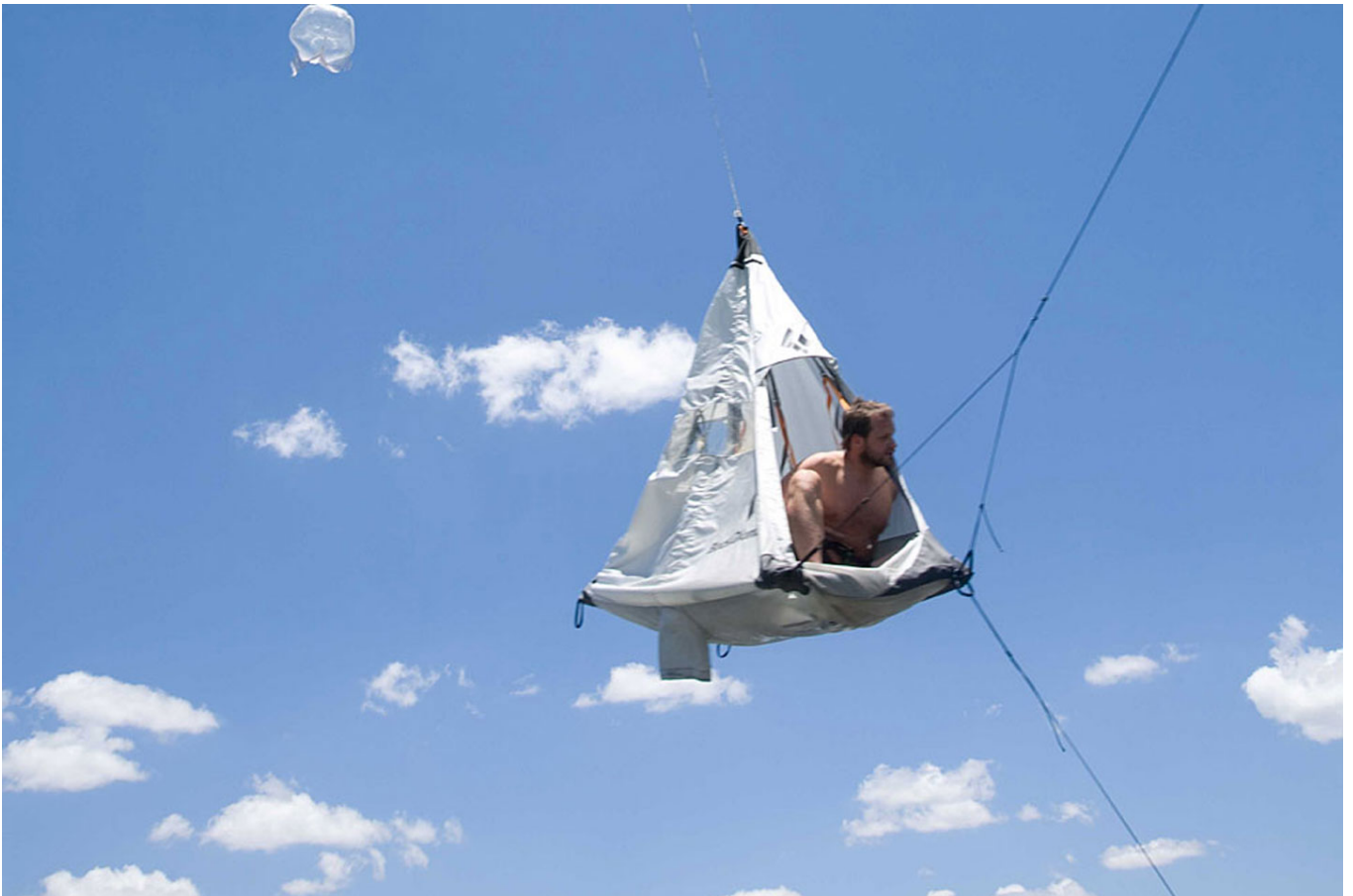
Tomás Saraceno, Space Elevator , 2009–10.