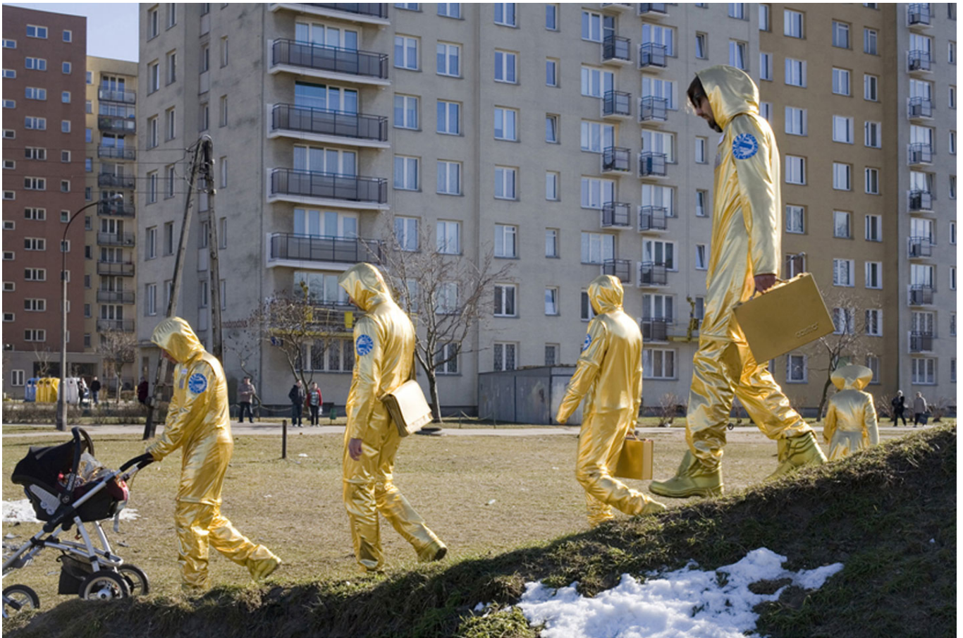
Pawel Althamer, Common Task , 2009. Courtesy the artist and Modern Art Oxford.