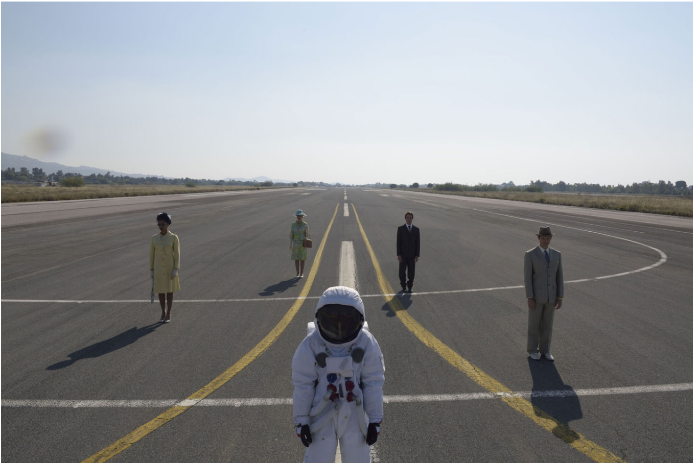
John Akomfrah, The Airport , 2015. Three-channel HD color video installation, 7.1 sound, 53 minutes.