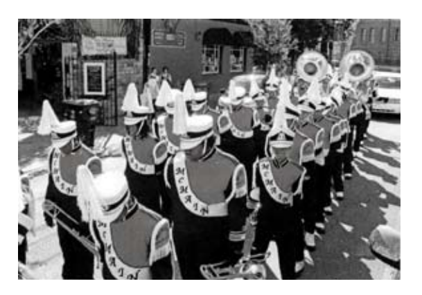
R.Luke DuBois, The Marigny Parade, 2011. Performance view, Eleanor McMain Secondary School, New Orleans, October 22, 2011.

WHEN CURATOR DAN CAMERON inaugurated Prospect New Orleans in 2008, billed as the largest international biennial in the United States, it was an act not merely of post–Hurricane Katrina revitalization but of civic reinvention. Though it received virtually no funding from depleted state or city coffers, Prospect.1 generated a great deal of curiosity, goodwill, and private patronage and brought contemporary art to the city in an unprecedented way. Due to cost overruns for the first show and reduced corporate funding since the recession, Prospect.2 was postponed one year and was a significantly smaller venture: It featured only twenty-seven artists, few of whom produced newly commissioned works.