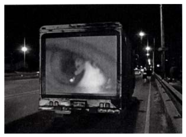
William Pope.L, Blink , 2011, mixed media, Installation view, New Orleans.